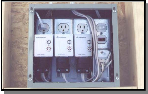
BEFORE (during construction)